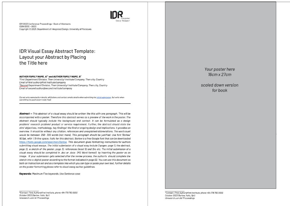
Fig. 1: Layout of the IDR 2023 Conference Proceedings - Abstract